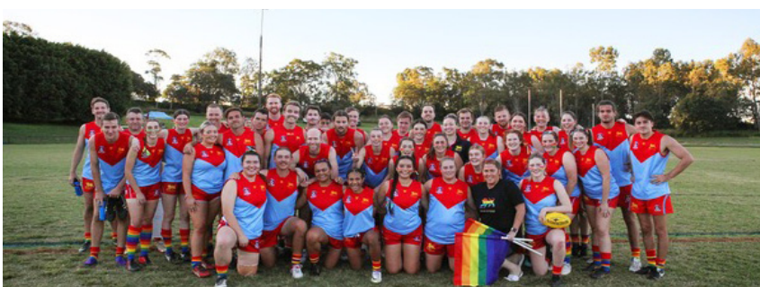
Women and Men's Teams 2021