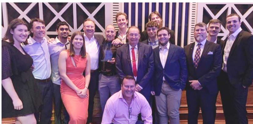
AFL Queensland Alpha Sport Awards Community Club of the Year 2024

If you decide to generously support Kedron FC and become a sponsor or donator, please fill the form out at the end of this document or contact us via email at marketing.kedronafc@gmail.com