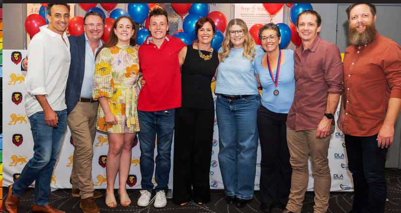
Youth and Fairest Awards Night 2024