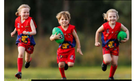
Courier Mail, photo Lachie Millard