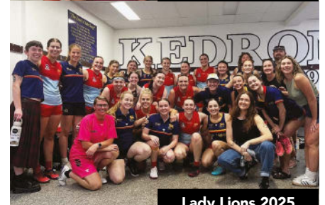
Lady Lions 2025