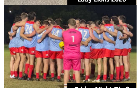
Friday Night Div 3