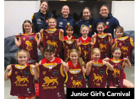
Junior Girl's Carnival