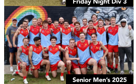
Senior Men's 2025